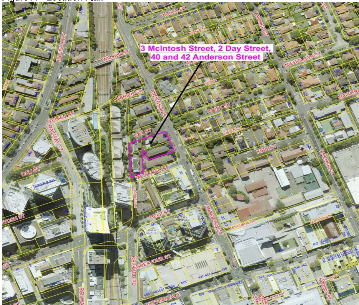
Figure A – Location Plan

The site is located approximately 350m from the Chatswood Railway Station and Transport Interchange and within the expanded Chatswood CBD boundary identified in the CBD Strategy.